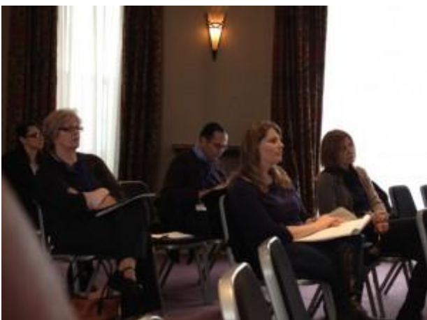
Panel 1: "A Nation in Crisis: National Identity, Radical Right and Immigration in Greece"